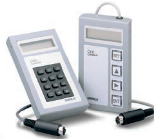
▲ Remote-console unit for setting C110/C120